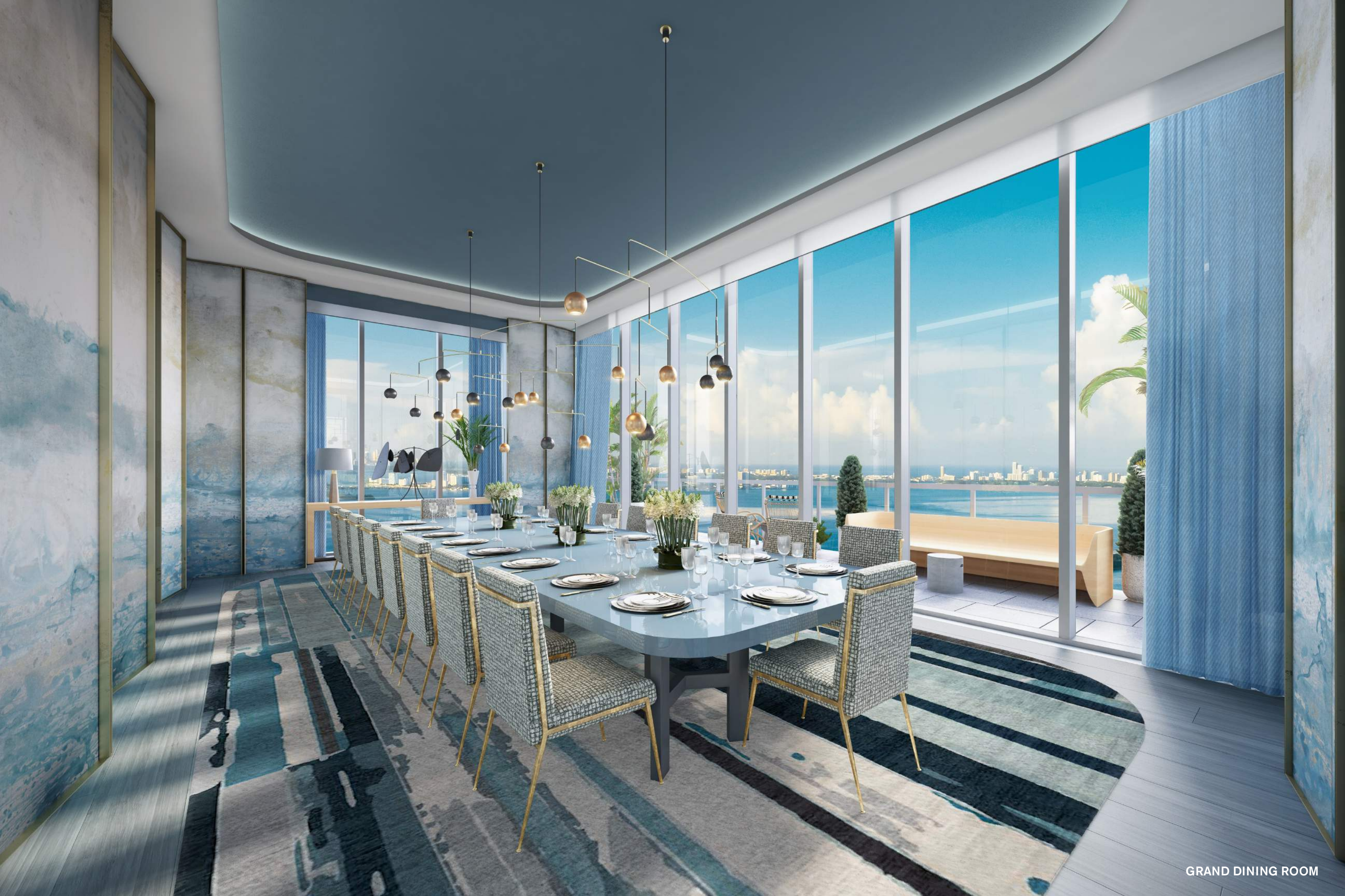
GRAND DINING ROOM